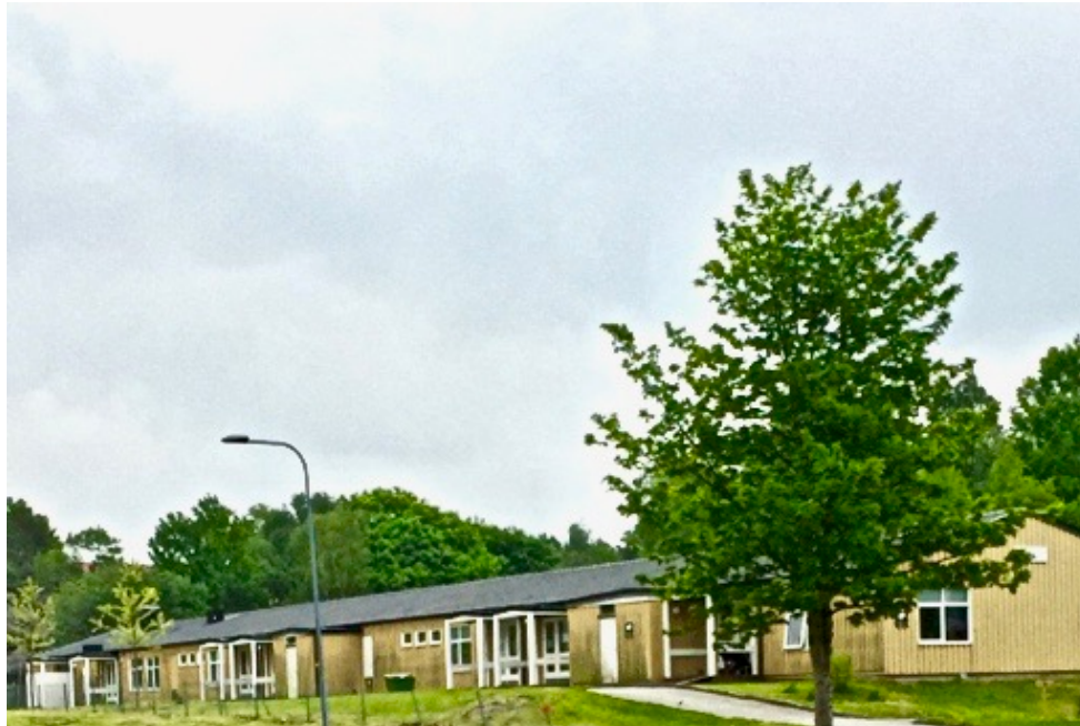
Picture 1 – Example of pre-school building built during the millennium program

the preschools in the initial pilot project (for a detailed description of the organization and the development of the strategy project, see paper I).